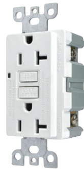
TGM20 20A GFCI, NEMA 5-20 120V/60Hz UL2008 Standard