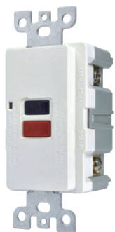
TGM1 20A GFCI 120V/60Hz UL2008 Standard