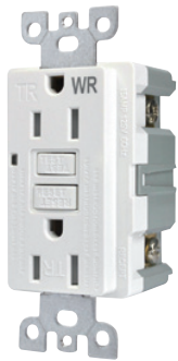
TGMT15 WR 15A GFCI, Tamper & Weather Resistant NEMA 5-15, 120V/60Hz UL2008 Standard