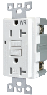
TGMT20 WR 20A GFCI, Tamper & Weather Resistant NEMA 5-20, 120V/60Hz UL2008 Standard